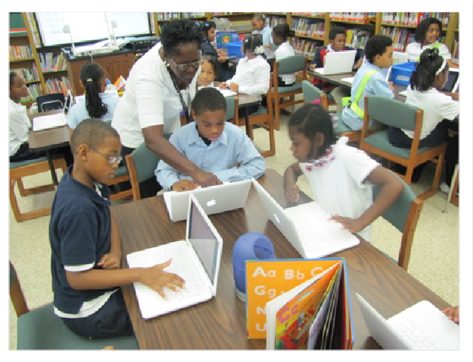
Elementary students at Mann Learning Community study Spanish in the school library.

These reports, submitted on time, reflect the fact that we are moving solidly in the right direction. Careful financial planning, sacrifices across the board while maintaining a focus on teaching and learning have paid dividends. A number of key financial initiatives that the District has initiated to enhance financial and budget operations are beginning to take effect and when fully implemented these will correct years of broken systems that have too often kept good people from doing great jobs.