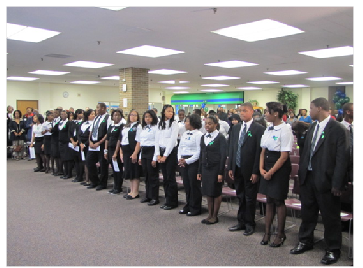
Inaugural class at Dr. Benjamin Carson High School for Science and Medicine.

This fall, student enrollment exceeded budgeted projections by 234 full-time students, based on numbers submitted which will be audited.