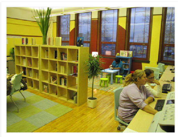
Parents access the Internet at one of DPS' eight Parent Resource Centers.

Detroit Public Schools generated its first annual operating surplus since 2007 and reduced its negative fund balance by over $43 million (13 %) for the 2010-11 fiscal year. DPS accelerated the elimination of its $327 million legacy deficit, reduced total expenditures by over 8% and reduced debt service cost by almost $6 million. These results are presented in the district's FY 2010-2011 Consolidated Annual Financial Report (CAFR) which was submitted as required to the Michigan Department of Education by the November 15 deadline. Taken in conjunction with the October 2011 $244.9 million financing which effectively results in eliminating $200 million of the school district's legacy deficit, DPS' deficit is projected to be $83.9 million.