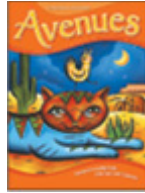
Level D/Grade 3