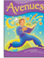
Level F/Grade 5