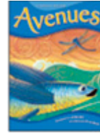
Level E/Grade 4