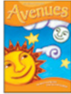
Level B/Grade 1