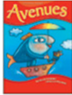
Level A/Grade K